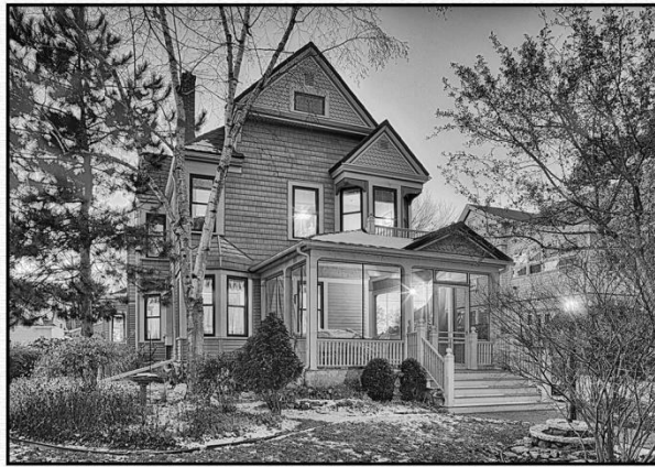
416 14th St. S.