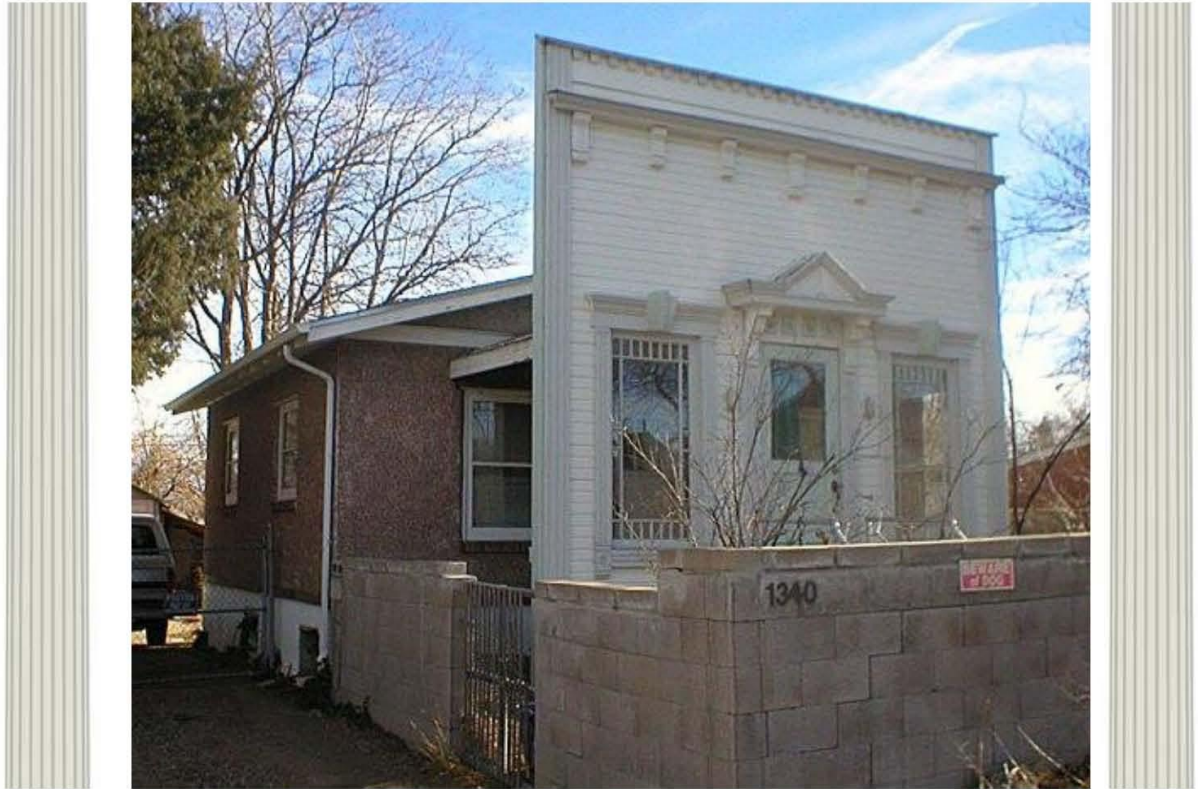
"Lipstick on a Pig"