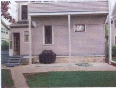
416 14 th St. S. Before

an explanation of common designs and their issues along with thoughts on repair and prevention.