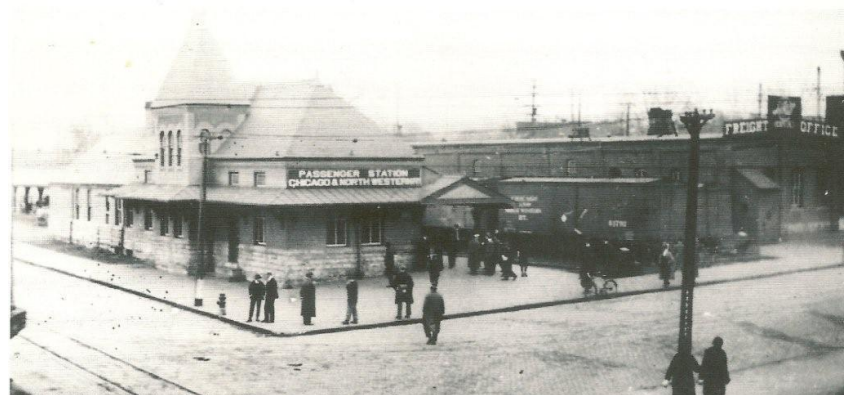
Two views of the Chicago & Northwestern Passenger Depot that stood at 3rd and Vine.