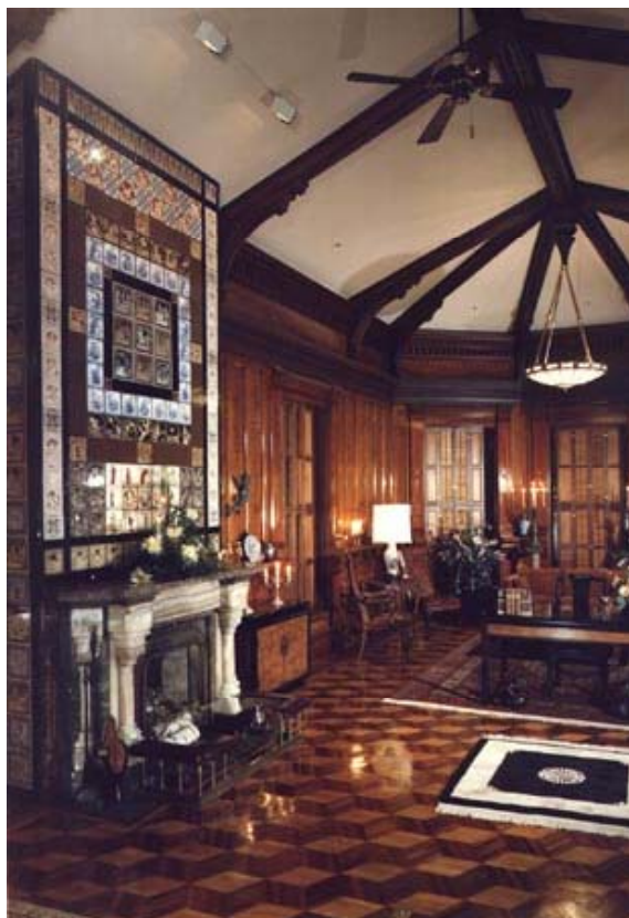
Mons Anderson House

PAL Heritage Awards Banquet, May 4, 6:00 at the Freighthouse.